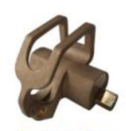
Brass Casting Parts