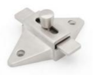
Steel Hinge Parts