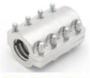
Building Equipment Fittings