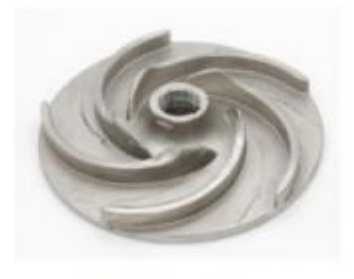
SS316 Impeller Parts